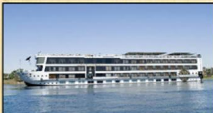
4 Day Nile Cruise to Nubia

Price includes taxes, fuel surcharges and visa fees.